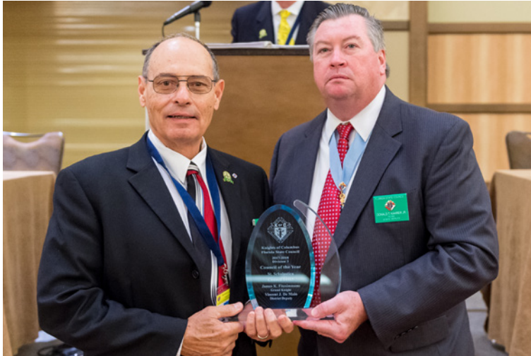
Division 3 Council of the Year

To earn the title of Council of the Year in division 3 requires a lot of dedication, tenacity and perseverance. More award applications are received from division III councils than from division II and I councils combined.