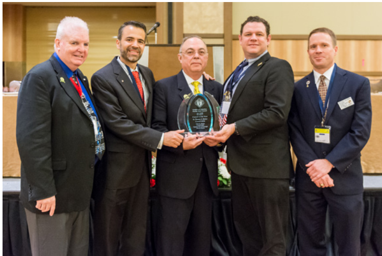
Division 1 Council of the Year

This Council of the Year participated in Habitat for Humanities, Laps for Life to raise moneys for the local pregnancy center and to spread Pro-Life messages to college students. Supported Special Olympics and supported two seminarians by hosting a monthly luncheon.