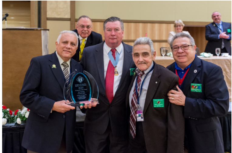
Division 2 Council of the Year

They recognize Knights of the Month and Family of the Month, they established a tradition of first Friday of the month candle light adoration of the Blessed Sacrament. The 2017-2018 Council